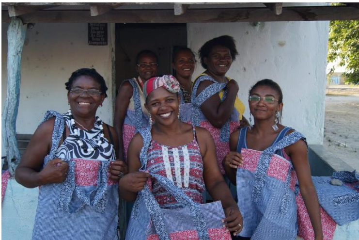
Women of Capoeiras