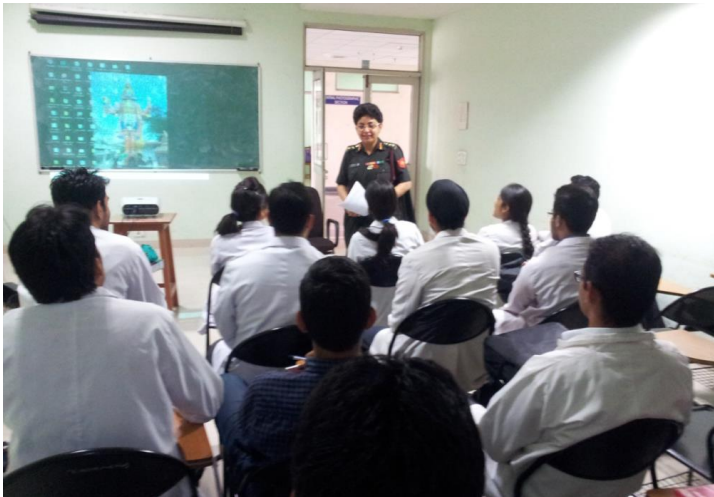
Brainstorming with the medical students

She and her colleagues developed a questionnaire to test the married women's knowledge, attitude and practices about anemia pre- and 3 months post-intervention. They also organized lectures with discussion sessions and street plays for the women. Students worked under faculty supervision to test the women and their children for anemia and carried out deworming and iron/folic acid supplementation in standard doses.