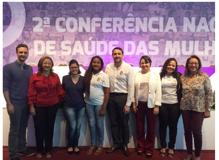
2017 Prize for Barriguda Project from WHO PAHO at 2 nd Brazilian Women's Health Conference