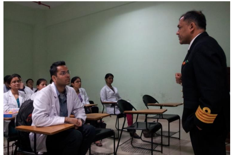
Communication skills workshop