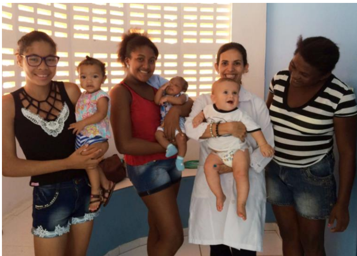
Staff and community members at Capoeiras health center