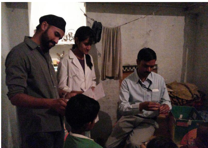
Students interviewing women for questionnaire