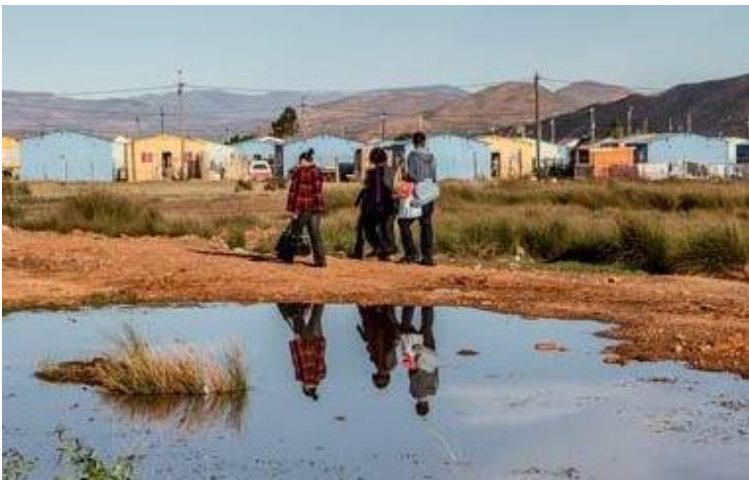
Students doing hoe visits in Avian Park student clinic