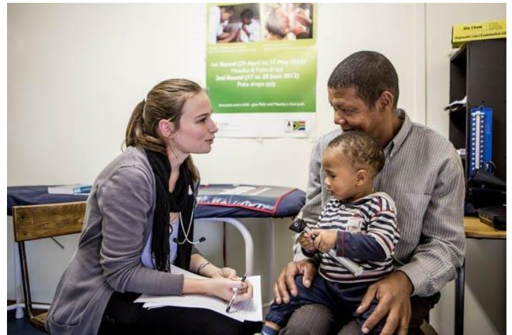
Student in consultation with patients