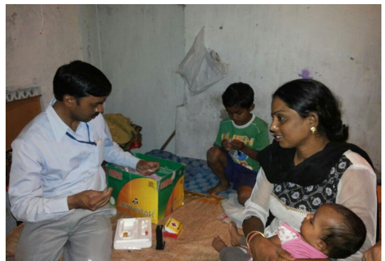
Blood tests in progress for women and children