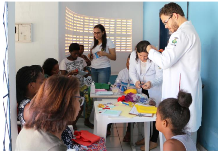
Activity in the community health center